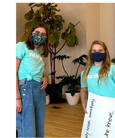
AC students filming for the Best Buddies of Western New York's virtual gala.

Despite the unusual challenges of this past year, AC students continued to embrace opportunities to apply their learning in the real world. This year's AC Production and Design students collaborated with WROC to produce the Best Buddies of Western New York chapter's largest fundraiser of the year. The students were responsible for creating and producing vignettes, commercials, and promotional social media content for the virtual gala. Their work culminated in a 30-minute, pre-recorded program that aired on WROC. The gala raised more than $35,000 for programming across Western New York.