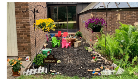
From drab to fab! AC nursery schoolers use their creativity to transform this outdoor space.