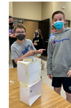
Sixth-grade students working together on a STEM challenge.