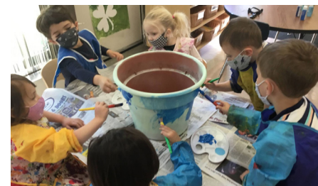
Students work on decorations for the new fairy garden in the outdoor space by their classroom.

AC nursery schoolers were hard at work this past spring creating a fairy garden. After reading many different gardening, construction, and fairy books, each student used their spatial awareness skills to create a blueprint of their new outdoor space. Raking the mulch and moving stumps, sticks, and rocks around challenged their gross motor skills. Their individual artistry truly shined while assembling wind chimes, painting rocks, and constructing miniature furniture. Skills in creative expression and storytelling skyrocketed as our three and four year olds took on the roles of fairies, gnomes, and giants during pretend play.