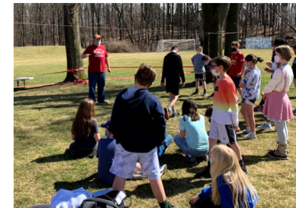
Sixth-grade students take a break from their screens to get outside and try their skills on the slackline.

Sixth grade students participated in a three day retreat in April centered around the themes of "me, you, we". This retreat gave them the opportunity to step away from their Chromebooks and engage in activities, including slackline, obstacle courses, STEM activities, reflective writing, and group discussions around various topics.