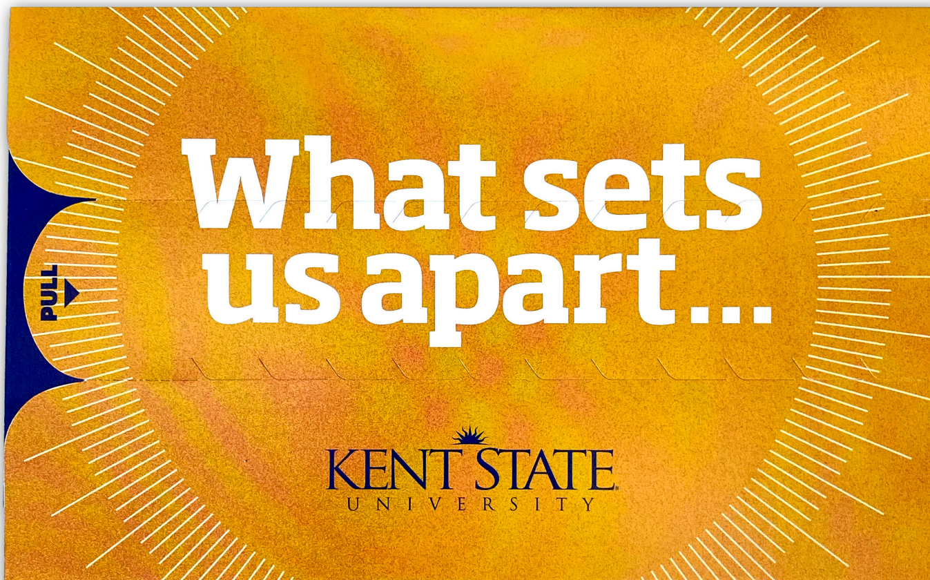
COVER - SELF-MAILER